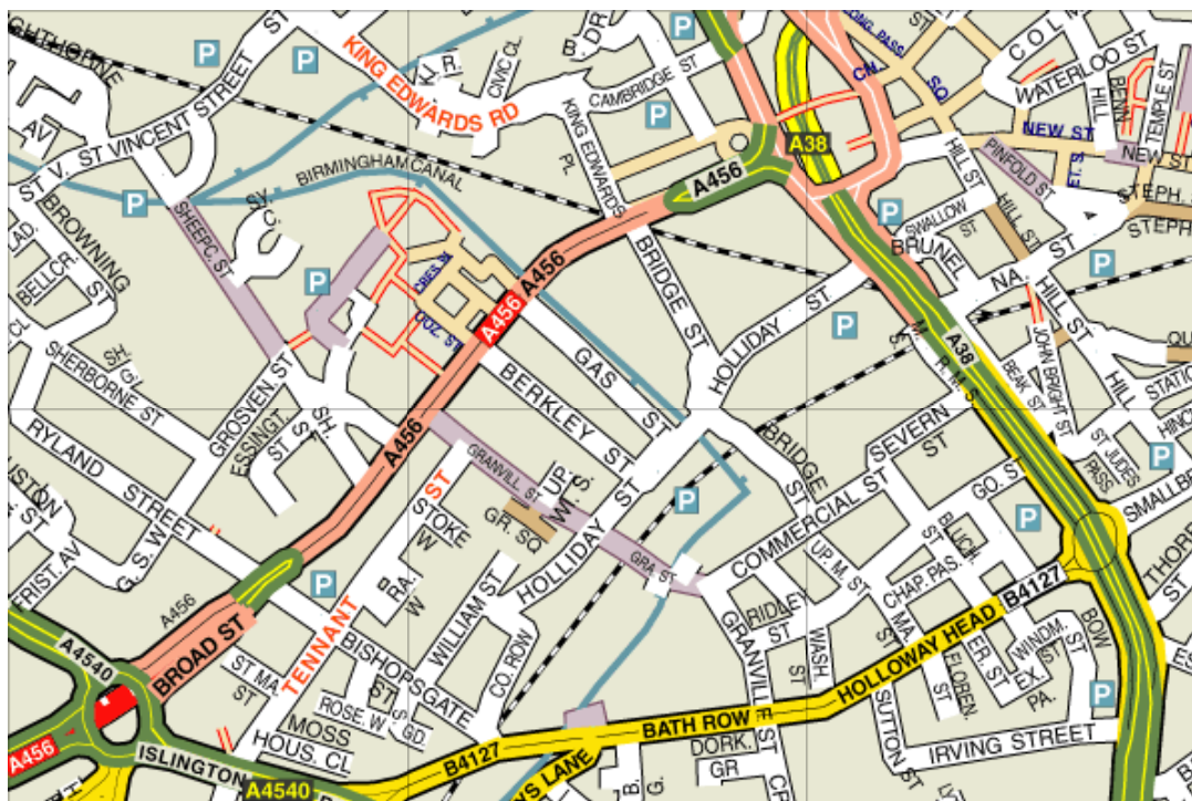
Jimmy Spice's – backs onto the marina by Gas Street

Valid only on Wednesday 24 th June and Thursday 25 th June